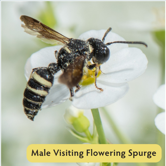
Male Visiting Flowering Spurge