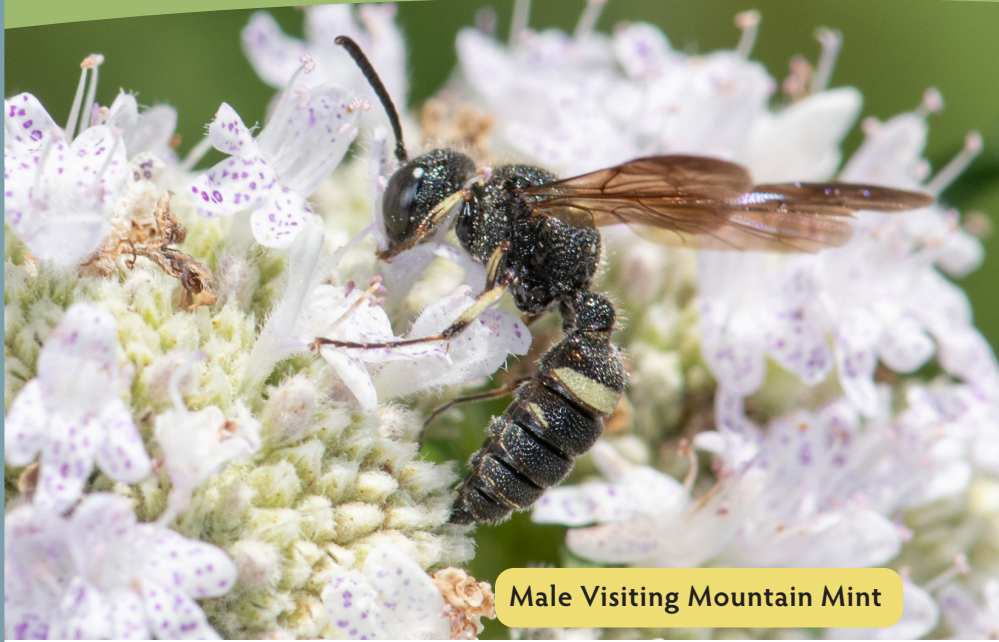
Male Visiting Mountain Mint

Scientific Name: Cerceris fumipennis (Crabronidae)