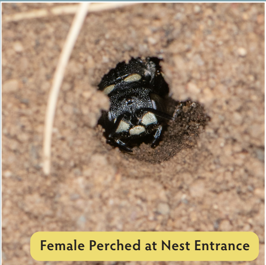
Female Perched at Nest Entrance