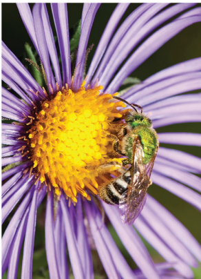
New England Aster Symphotrichum novae-angliae