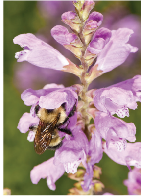
Obedient Plant Physostegia virginiana