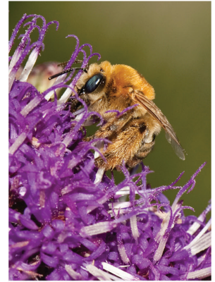
Ironweed Vernonia fasciculata