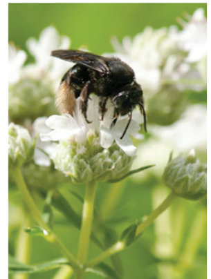
Mountain Mint Pycnanthemum virginicum