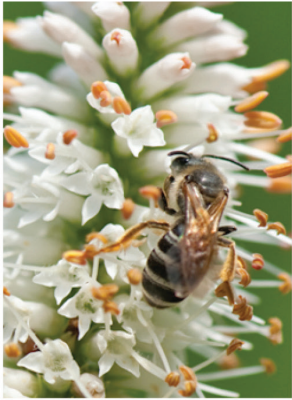
Culver's Root Veronicastrum virginicum