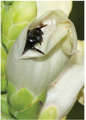
White Turtlehead Chelone glabra