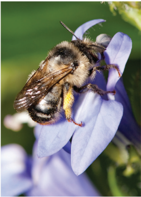
Blue Lobelia Lobelia siphilitica