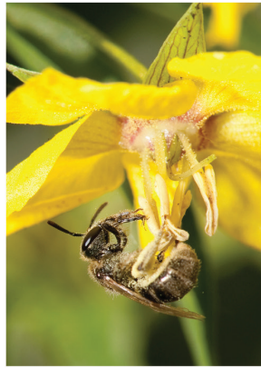
Fringed Loosestrife Lysimachia ciliata