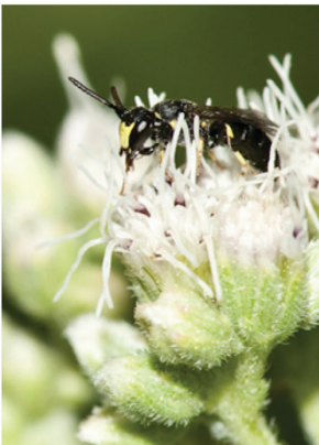
Common Boneset Eupatorium perfoliatum