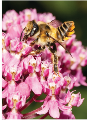
Swamp Milkweed Asclepias incarnata