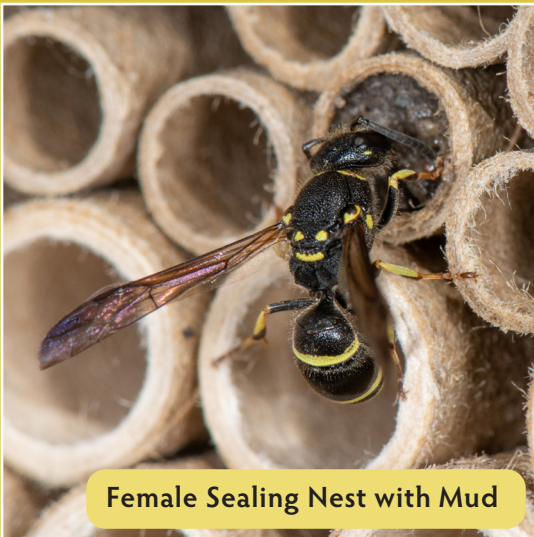
Female Sealing Nest with Mud