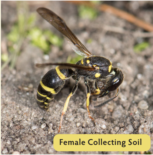
Female Collecting Soil