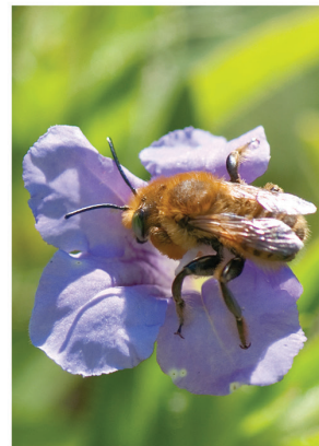
Wild Petunia Ruellia humilis