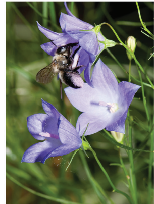
Harebell Campanula rotundifolia