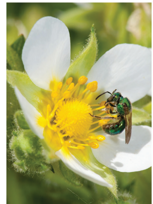
Prairie Cinquefoil Potentilla arguta