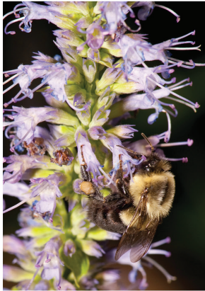
Fragrant Hyssop Agastache foeniculum