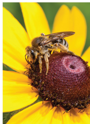
Black Eyed Susan Rudbeckia hirta