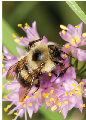
Prairie Onion Allium stellatum