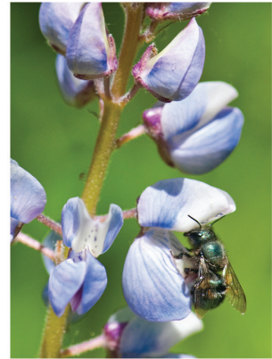
Wild Lupine Lupinus perennis