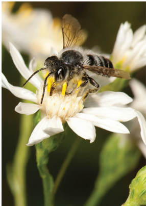
White Upland Aster Aster ptarmicoides