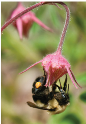
Prairie Smoke Geum triflorum