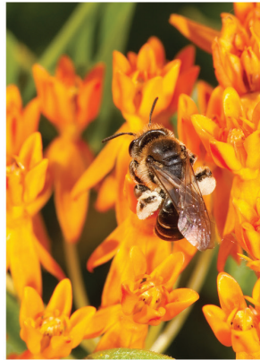
Butterfly Milkweed Asclepias tuberosa