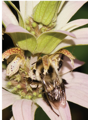
Spotted Bee Balm Monarda punctata